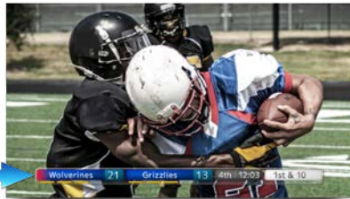
The camera receives score info directly from a mobile device

The GY-HM200SP produces a real-time score overlay on recorded or streamed video output for a variety of popular sporting events including football, soccer, volleyball, hockey and more. The overlay is produced for both the streamed and recorded video simultaneously.