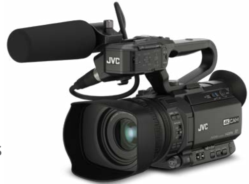
Camera shown with optional shotgun mic

Sports Production, Live Stream capable compact handheld camcorder with integrated 12x zoom lens